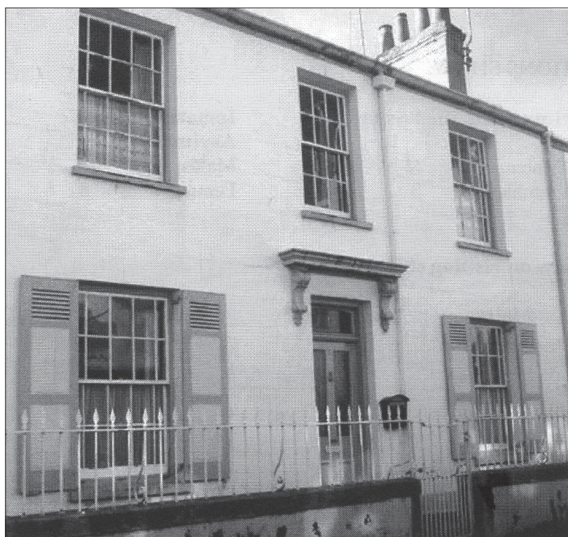
L'Abri, 7 Devonshire Lane, built in 1861 by Charles De Gruchy who was then living at 12 Lemprière Street, St Helier